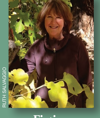
Fiction Minrose Gwin The Accidentals