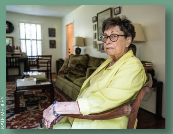
Special Achievement Award Mississippi Delta Tennessee Williams Festival