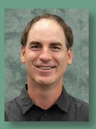
Po' Monkey's: Portrait of a Juke Joint