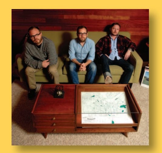
Music Composition (Popular) Water Liars Water Liars

Lake Trace Convention Center Hattiesburg, Mississippi