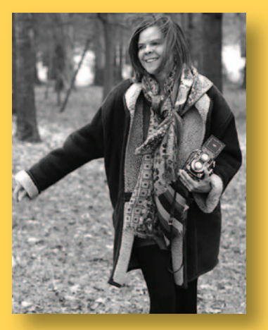
Photography Maude Schuyler Clay Delta Dogs