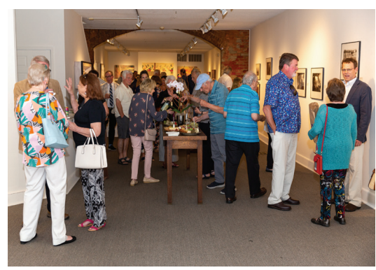
Guests enjoy the reception at Southside Gallery on Friday evening