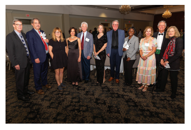
2023 MIAL Award Recipients