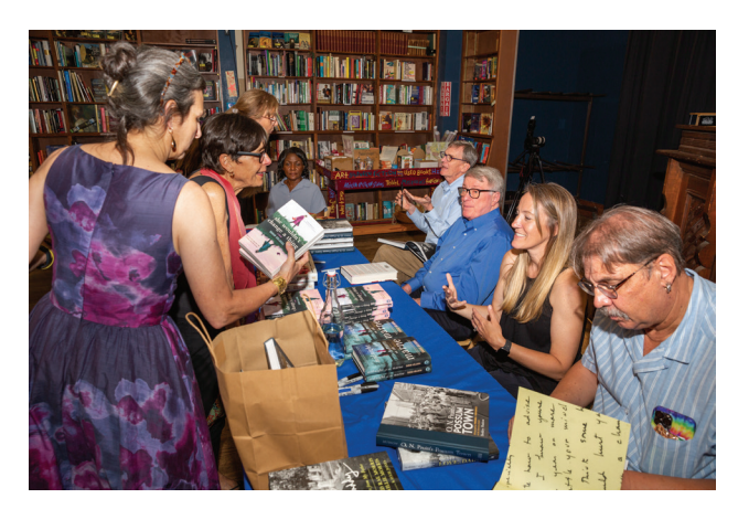
Book Signing at Off Square Books