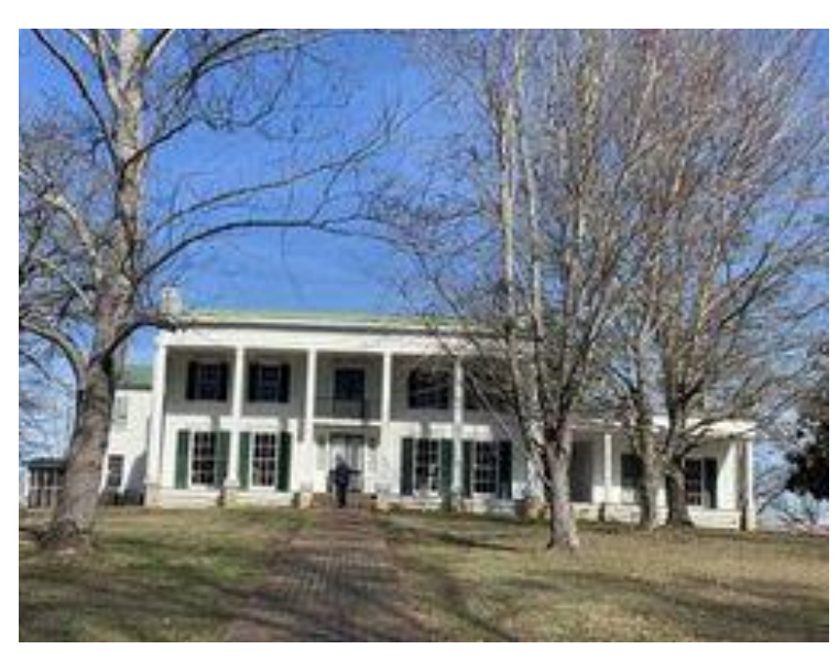
Cotesworth Culture and Heritage Center