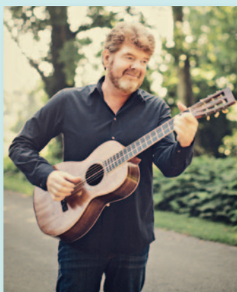
Music Composition (Contemporary) Mac McAnally AKA Nobody