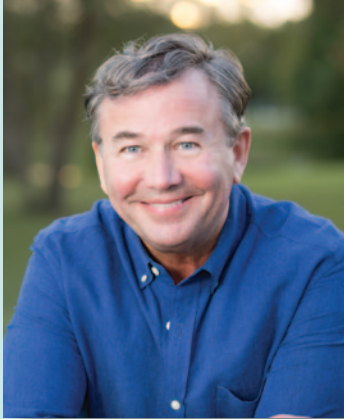
Fiction Taylor Kitchings Yard War