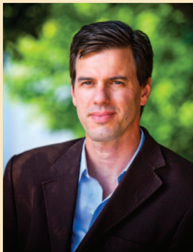
Nonfiction Joseph Crespino