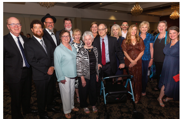
MIAL Board of Governors enjoying the Awards Banquet