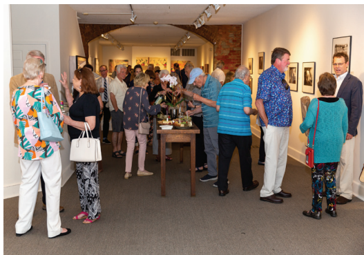
Guests enjoy the reception at Southside Gallery on Friday evening