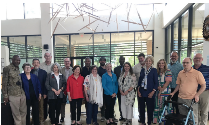
MIAL Board of Governors met in September at the Mississippi Museum of Art.