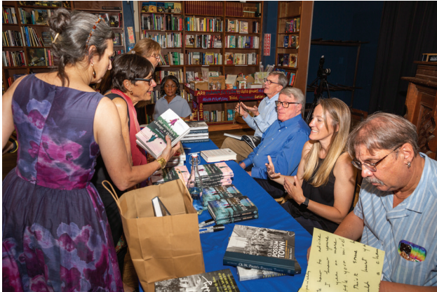
Book Signing at Off Square Books