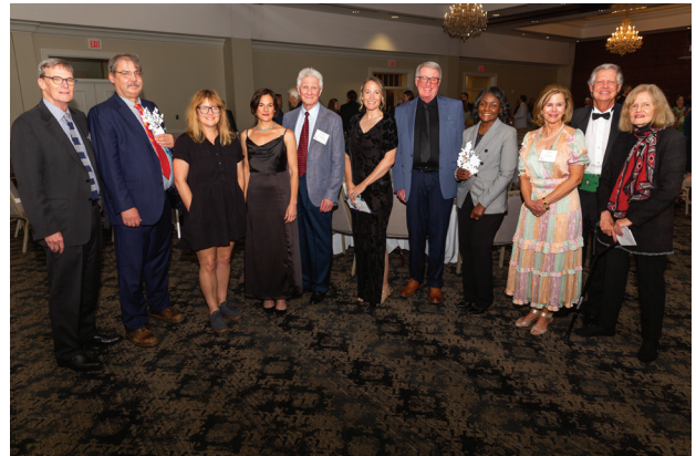
2023 MIAL Award Recipients