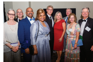
Friends and Supporters of Tupelo Reads