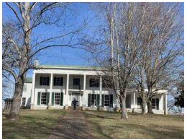
Cotesworth Culture and Heritage Center