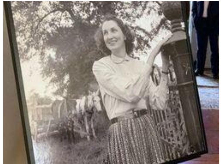
Elizabeth Spencer pictured in 1957 in front of the Courthouse in Carrollton.

Approximately 85 friends and admirers gathered at Cotesworth Culture and Heritage Center in Carrollton to celebrate the life of Elizabeth Spencer on February 15, 2020. Readings from the works of Ms. Spencer included The Voice at the Back Door , Light in the Piazza , The Salt Line , Landscapes of the Heart and “The Day Before.” Organized by the Mississippi Institute of Arts and Letters, a complete list of sponsors is listed on page 4.