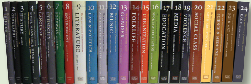
Special Achievement Award The Center for the Study of Southern Culture The New Encyclopedia of Southern Culture, 24-Volumes